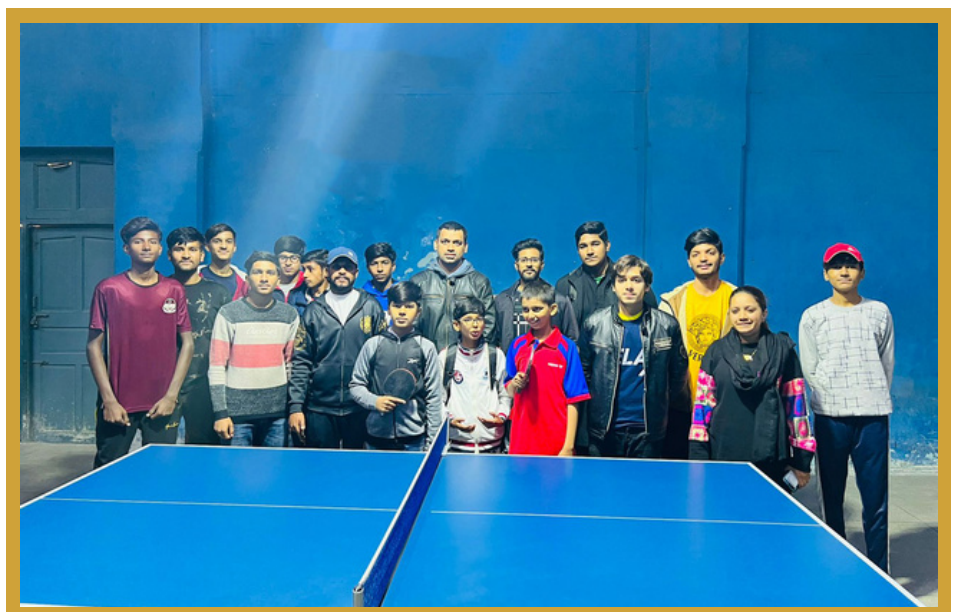
Congratulations to our Table Tennis Champions on winning in the Divisional Table Tennis Competition