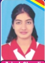
Zainab Ghazali 1049